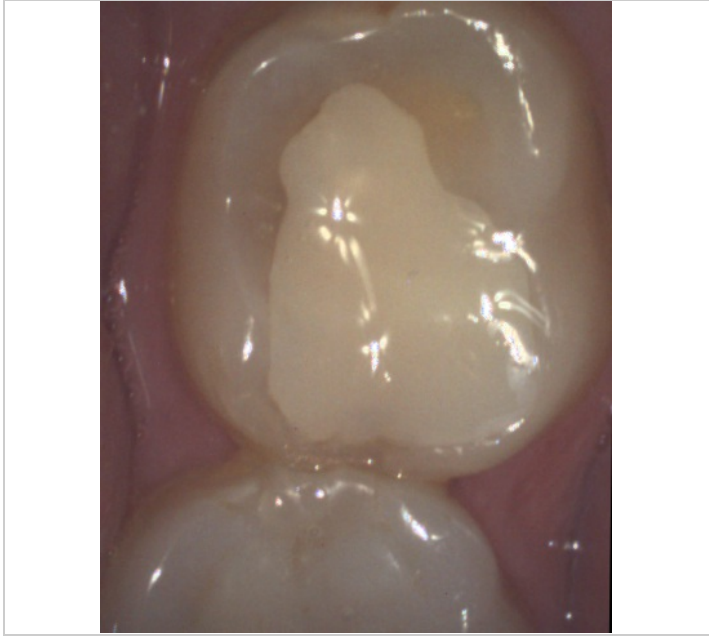
46 Old filling